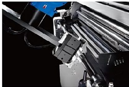
Auto Loader Seam Detector ( Optional )