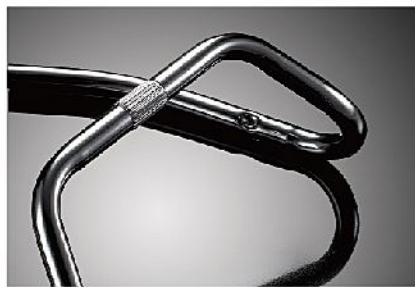
Punching ( Optional )